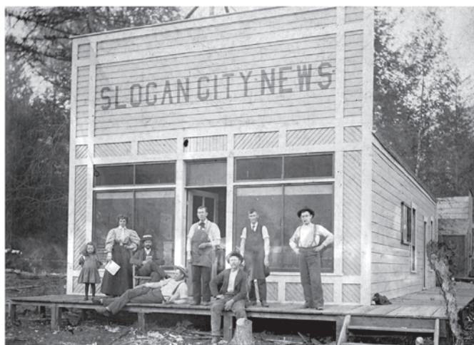
Slocan City Boom: The CPR started extending the Columbia and Kootenay Railway up the Slocan Valley in 1897. In 1901 Slocan became a city, with 12 hotels. In 1958 it was incorporated as a village.

TRAIL MUSEUM 1051 Victoria St. 250-364-0829 trailhistory.com Open June - Aug. Mon. - Fri. 10am - 4:30pm Free Admission