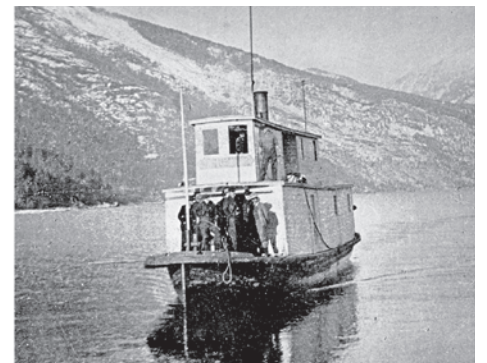
The SS William Hunter:

The first propeller-driven boat on Slocan Lake was built on the beach in New Denver (then Eldorado) in the summer of 1892. It provided the only service until the CPR launched the SS Slocan in 1897.